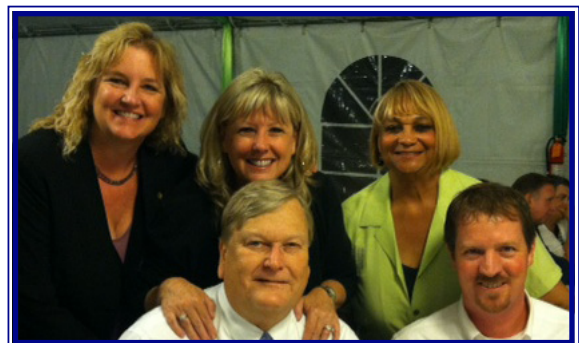
Region VII Delegate Assembly

SELPA issues - three issues identified: 1 - Mental health services potential funding issues in the future if the money gets rolled into the bas funding. 2 - Disproportionally triggers 15% of funding to be spend on early intervention and general education students. 3 - CTC and CDE are still not in agreement over the issue of utilizing special education teachers to serve general education students as an intervention. CTC is saying they are not highly qualified if they only have a SE credential and not a GE credential.