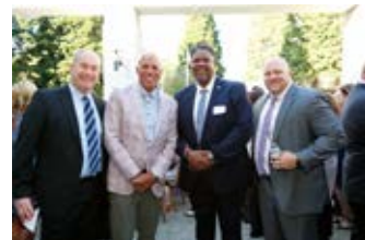
Thank you to many region superintendents for attending this celebration to support their district's honorees