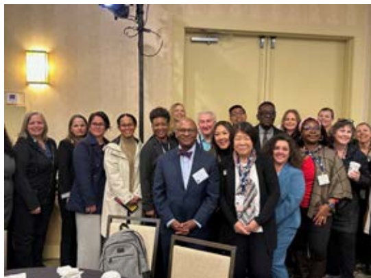
Region 6 showed up at the ACSA Equity Institute on March 12-14 in Berkeley.