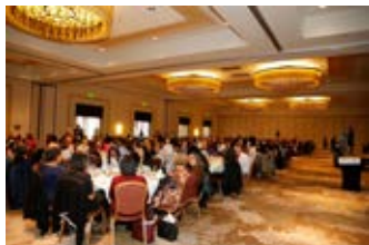
Over 300 guests attending the April 17 Region 6 Administrator of the Year Awards Dinner in San Ramon