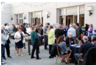
Members, friends, family gathering at the pre-dinner reception