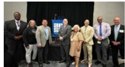
Delegation representing Region 6 at recent Leadership Assembly