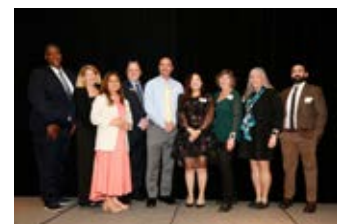
Outgoing R6 Board of Directors recognized for their leadership