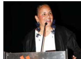
R6 Vice President of Programs and MC of the Awards Ceremony extending her welcome