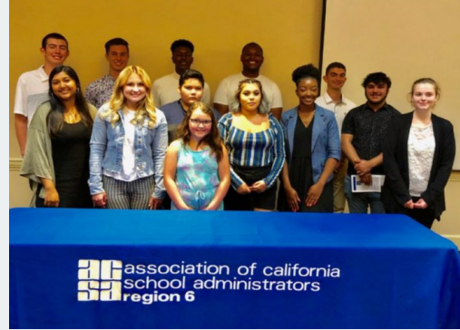
So proud of our recipients of student scholarships and Every Student Succeeding scholarships