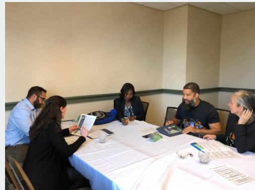
Region 6 team reviewing issue papers and preparing for their visit with legislators.