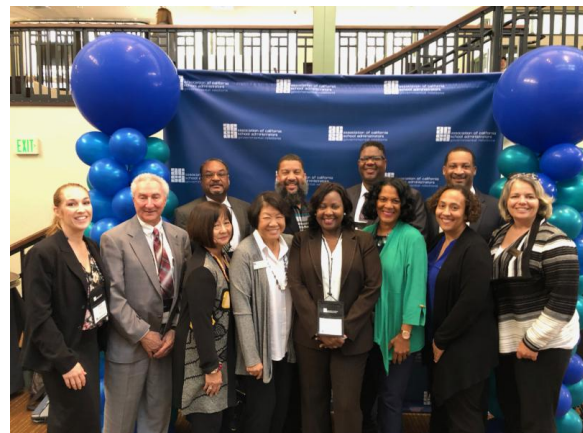
Region 6 delegation all set to hit the Capitol on April 8, 2019