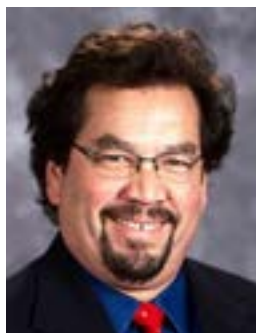
Robert Gröeber Business Services