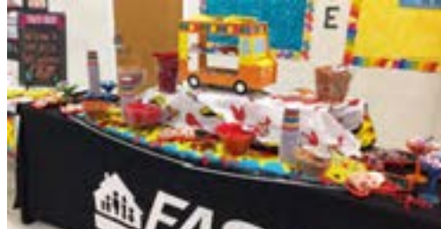
KINGS CHARTER FALL CONFERENCE IS A FIESTA OF INFO, NETWORKING PAGE 20