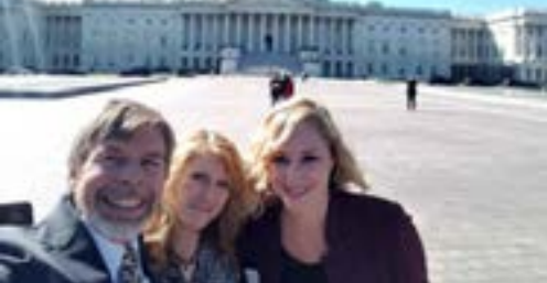
REGION XI WELL REPRESENTED IN WASHINGTON, D.C. PAGES 3 & 8