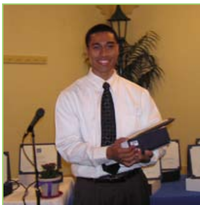
Every Student Succeeding Ala Tia Tia Senior Sherman E. Burroughs High School Sierra Sands USD