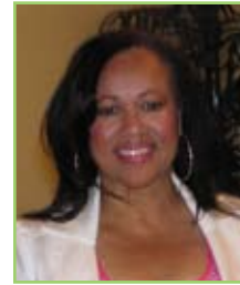
Ruscel Reader Elementary Principal