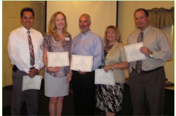
Region XI Charter Presidents...2011-2012

The charter held its annual Election and End of the Year Awards Program at Steve Bogan's Grove on May 11th, 2012