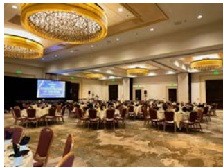
A beautiful venue ready for the evening's festivities