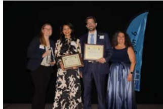
Nominees for R6 Middle Grades Co-Administrators of the Year