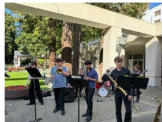
The talented Liberty High School Jazz Band performing at the pre-dinner reception