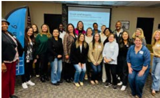
A dedicated group of R6 leaders engaged in learning together on a Saturday!