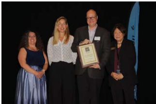
This year's Friend of Region 6 Award was presented to SPG Therapy and Education