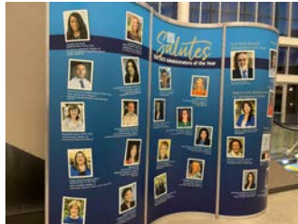
The Summit always culminates with the Administrator of the Year Awards celebration on Friday evening