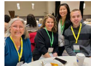
Castro Valley administrators attending the Summit for the first time!