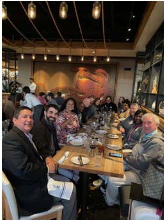
R6 leaders enjoying each other and building excitement for the Summit

Over 1000 attendees were in San Diego for the 2022 Leadership Summit earlier this month. As always, Region 6 ACSA members were well represented as participants and presenters.