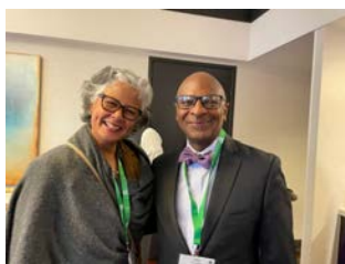
Reconnecting with an old friend and colleague at the ACSA Leadership Summit