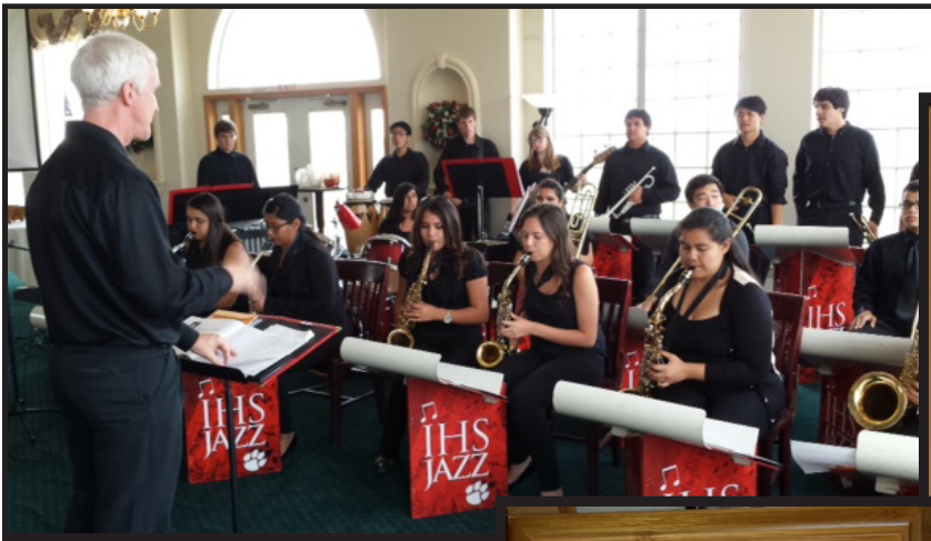
Imperial High School Jazz Ensemble

On May 22, 2014 at the Old Eucalyptus Schoolhouse, 197 educators, friends and family gathered to honor teachers, retirees and administrators from throughout Imperial County.