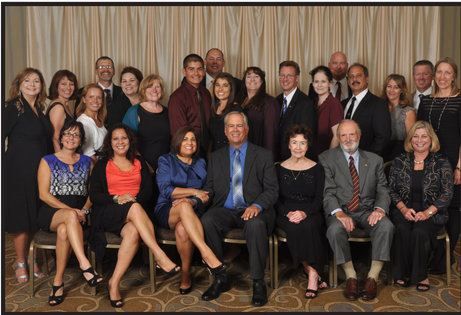
Ramona Unified School District