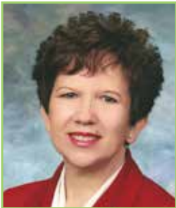
Region XI President