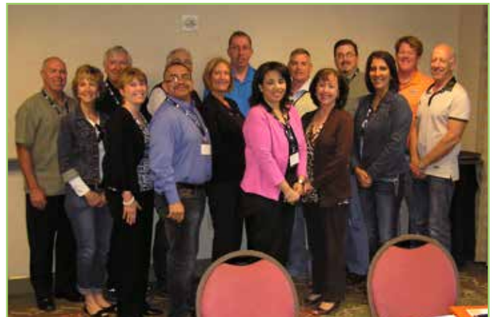
Region XI's Administrators at the 2014 Legislative Action Day.