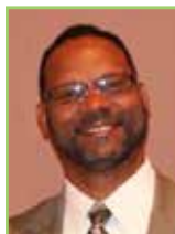
Warcester Williams Educational Options