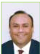
Fernie Marroquin Secondary Education