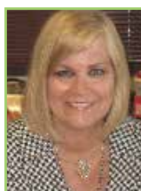
Deanna Clarke Elementary Education