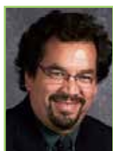
Robert Groeber Business Services