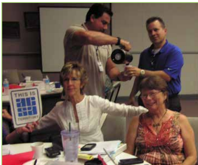
Region XI Planning Retreat "Coffee Break"

Increase membership by promoting ACSA with district level administrators.