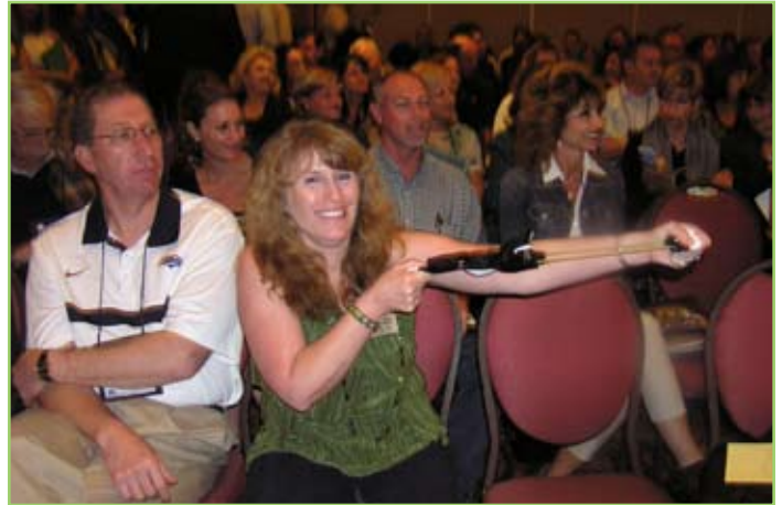
Region XI attendees at the Legislative Action Day Preparation Workshop. Our own Region XI Vice President - Legislative Action is enjoying the proceedings in Sacramento.