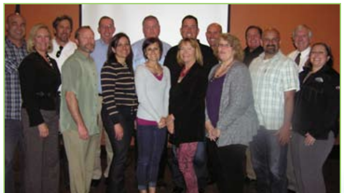
Inyo/Mono Charter Members in attendance at meeting held in Bishop on April 1, 2013