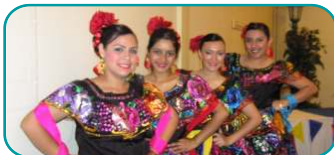
Entertainment Group Robert F. Kennedy High School, Delano