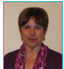
Clare Gist Business Services