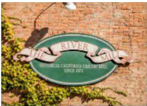
The River Mill in French Camp 1672 West Bowman Road French Camp, CA 95231 4 p.m. Seating Starts

ACSA Region 7 will be honoring our administrators of the year this spring. While we remain hopeful of an in-person celebration of leadership, we must plan for multiple scenarios. If we are able to meet in person, the event will be at the River Mill in French Camp, CA. If virtual, it will be a zoom recognition. Either way, the event will be held on Friday, April 30th. Please watch for registration information in March.