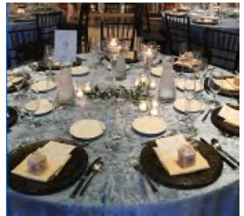
Awards Dinner & Presentation ACSA Region 7 Administrators of the Year 6:30 p.m.

PRE-REGISTRATION FOR THE EVENT WILL BE REQUIRED. REGISTRATION WILL TAKE PLACE IN MARCH, 2021