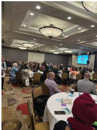
A roomful of administrators reflecting and celebrating another school year