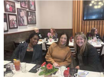
It was a luxury for some of us to have this time for good conversations