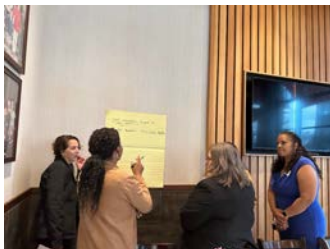
A small group brainstorming leadership hacks from their work