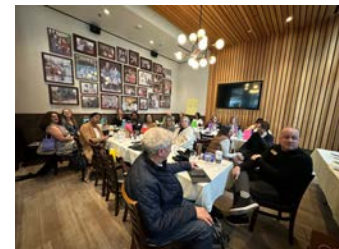
It was a quick morning but uplifting to find time and connecting with other leaders