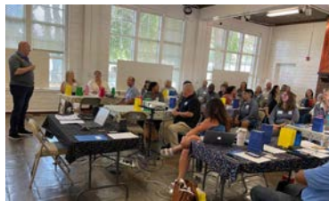
Over 40 members of the Region 6 Board of Directors participated in the annual Retreat at the Adobe Art Center and Gallery in Castro Valley