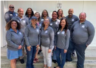
Here's our dedicated and hard-working Region 6 Executive Committee for 2024-25