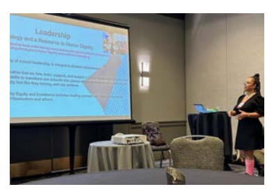
Zetha Nobles sharing successful equity practices in New Haven USD