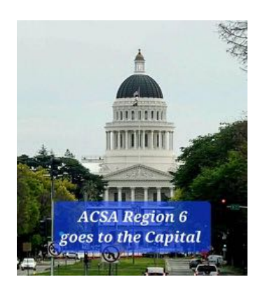
ACSA Legislative Action Day in Sacramento on April 17 & 18, 2023