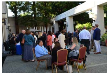
Guests gathering during the cocktail hour