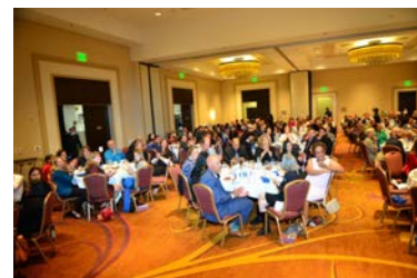
Attendees enjoying the festivities