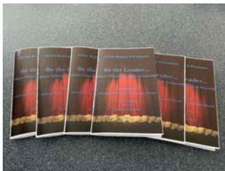
2022 Awards Dinner Program

The Region 6 Administrator of the Year Awards Dinner on August 28 was a sold-out event and drew almost 300 attendees. The group was excited to be at our in-person celebration at the San Ramon Marriott to recognize almost 70 administrators of the year and a dozen Region 6 leaders.