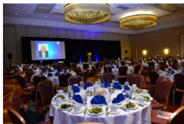
A beautiful room set up ready for our guests