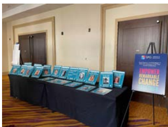
Posters of winners were printed by our Partner Shoob Photography