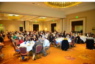
Looks like attendees enjoying