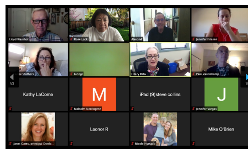
Region 6 members learning about due process for administrators, timelines for reassignments, demotions, discipline, etc.