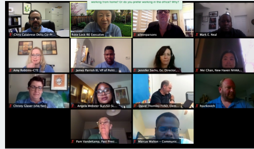
Breakout groups reflecting on 2019-20 goals and making recommendations for 2020-21