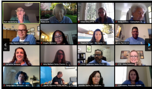
Members of Region 6 Board of Directors meeting virtually for annual Leadership Retreat