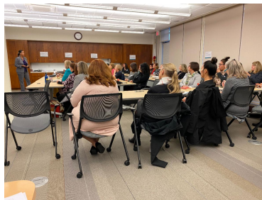
Region 6 leaders focused and engaged