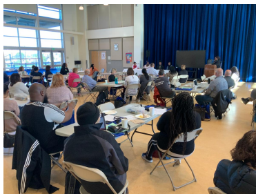
These leaders spent a Saturday at Emery HS building their capacity as a leader in equity. Here they are listening to a panel of students.