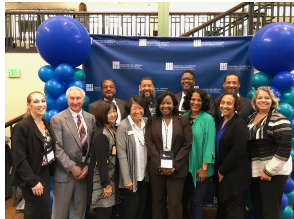
Region 6 delegation all set to hit the Capitol on April 8, 2019