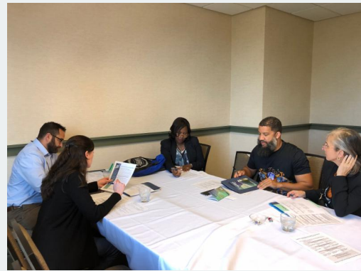
Region 6 team reviewing issue papers and preparing for their visit with legislators.