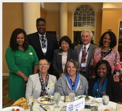
Region 6 delegation to ACSA Leadership Assembly

At the May Leadership Assembly in Sacramento, your Region 6 President, President-Elect and Treasurer participated in a leadership training with ACSA leaders and staff. This was an opportunity for region leaders to develop a deeper understanding of ACSA and its current focus. Much time was spent on the second day with region delegates on the progress of ACSA's Strategic Plan in meeting Year 1 milestones. Region delegation was given time to plan for Year 2 milestones. You will hear more during this coming year.