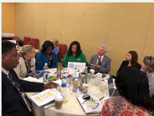
Region 6 Delegates discussing region progress on Year 1 milestones of ACSA Strategic Plan