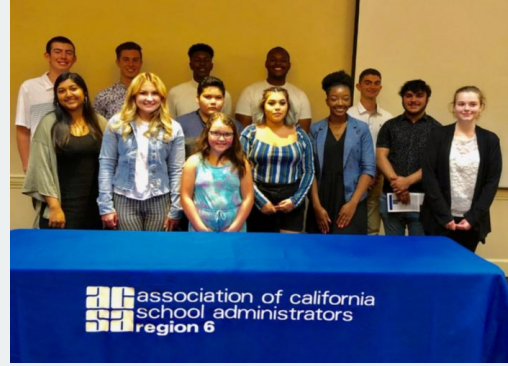
So proud of our recipients of student scholarships and Every Student Succeeding scholarships