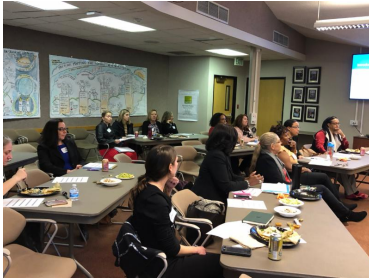
A roomful of engaged women leaders learning to be more empowered.