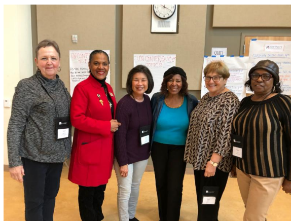
These retired administrators and leadership coaches modeling lifelong learning.