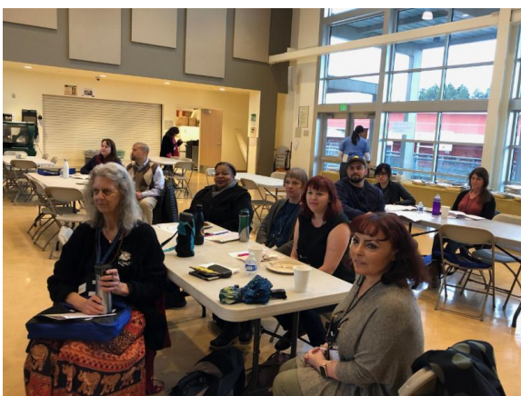
Another group of committed group of leaders are captivated by the Superintendents Panel.