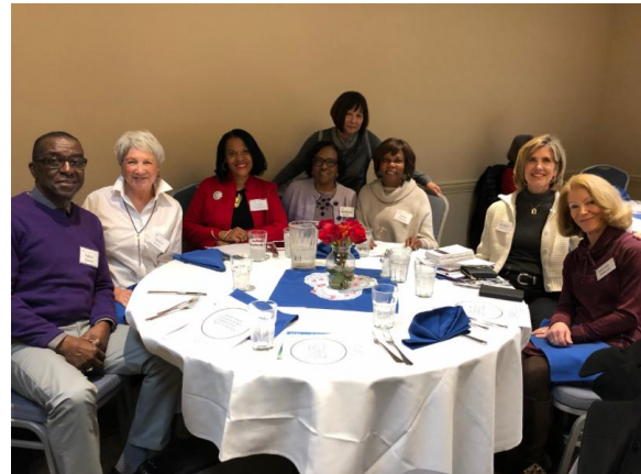
A group of retired Region 6 leaders catching up.