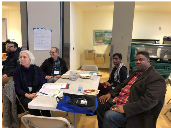
"Equity is not going to take hold unless it is embedded in our conversations and our work."