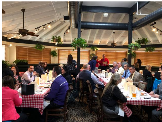
Over 30 administrators were recognized at the Charter's Local Leadership Event