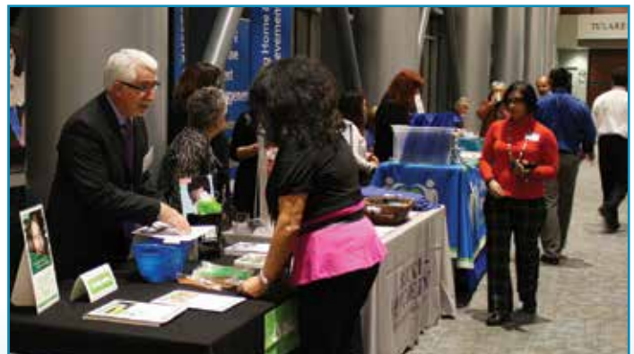
Ten vendors had opportunities to display their products and meet with administrators