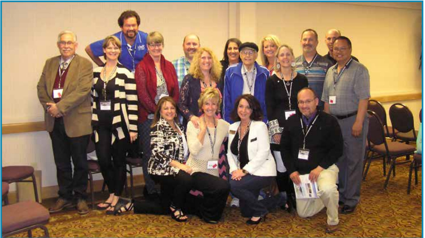
This is a portion of the 75 administrators from Region XI who attended this first annual Mid-State ACSA Conference. Region 9, 10, 11 and 13 joined forces to sponsor an outstanding conference • Region XI administrators presented seven breakout sessions.

Embassy Suites, San Luis Obispo • Regions 9-10-11-13 • March 11-13, 2016 REGION XI WELL REPRESENTED