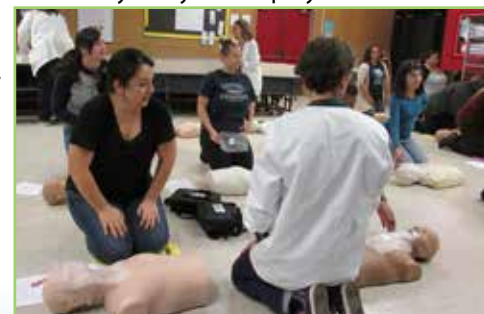
CPR/AED staff training...Richland School District